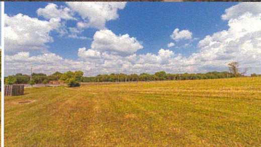
1429 New Columbia Hwy. 1.20 +/- Acres 151 sq. ft. road frontage