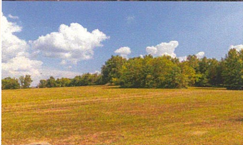
1427 New Columbia Hwy 6.5 +/- Acres 785 sq. ft. road frontage